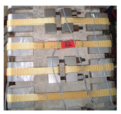
Figure 1. Pre-tensioning technique for carbon (left) and aramid FRP belts (right).